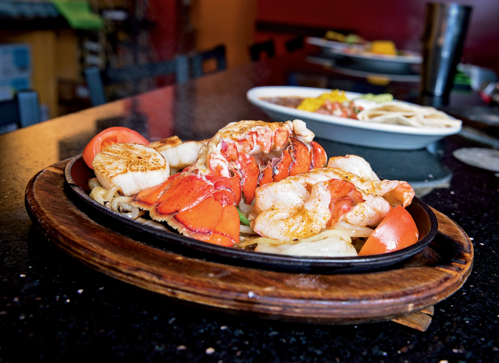
SIZZLING SELECTIONS: THE FOODIE SAYS THAT MARIACHI COOKS UP A VARIETY OF SAVORY OPTIONS GUARANTEED TO SATISFY THOSE CRAVINGS FOR AUTHENTIC MEXICAN FLAVORS.